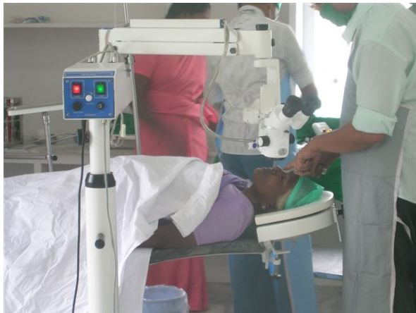
Cataract surgery being done at the Eye Clinic

Not every one can go to the ends of the earth and proclaim. For each one who proclaims, there are several who stay behind and help. Any mission work is difficult. We walk a very difficult path and we chose that path joyfully, wholeheartedly, and willingly. With Christ in our hearts, we beg you to consider how God may be calling you to respond generously in partnering in this Kingdom work—please give! And it's not us it's our Lord Jesus Christ who appeals today.